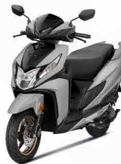
PEARL DEEP GROUND GRAY (EMBLEM)