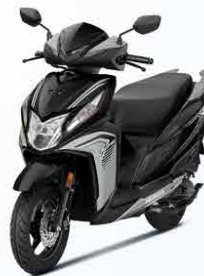
PEARL DEEP GROUND GRAY (STRIPE)